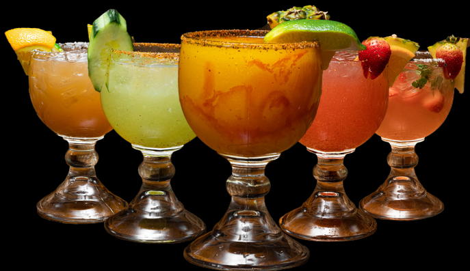
Strawberry Mint Margarita