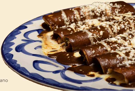
Enchiladas Mole Poblano